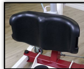
Contoured knee pad with 3 height settings