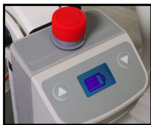
LCD battery level display; audible low-battery indicator