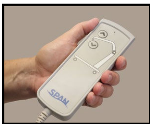
2-button pendant with LED indicator