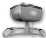
Fixed and portable lithium-ion overhead lifts