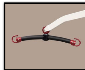
2-point spreader bar accommodates a variety of sling options.