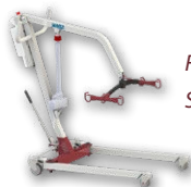
Full body and Sit-to-Stand floor lifts