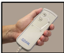
2-button pendant with LED indicator.