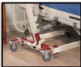
Underbed clearance allows use with most low beds.