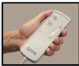
2-button pendant with LED indicator.