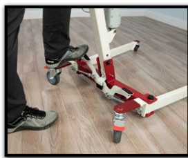
Foot pedal base width adjustment.