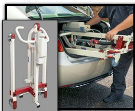
Folds flat for easy transport and storage.