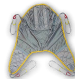
Re-usable and disposable specialty slings