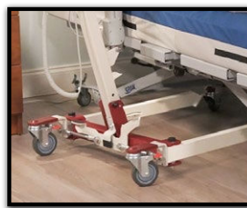
Underbed clearance allows use with most low beds.