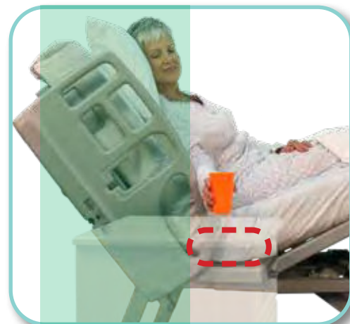
Encore: seat deck retracts during HOB elevation maintaining the user in a safer comfortable zone of vertical alignment (shaded green).

Why vertical alignment is vital in long-term care: