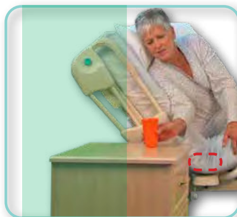
Ordinary fixed deck bed: the seat deck does not move during HOB elevation, forcing user out of vertical alignment.