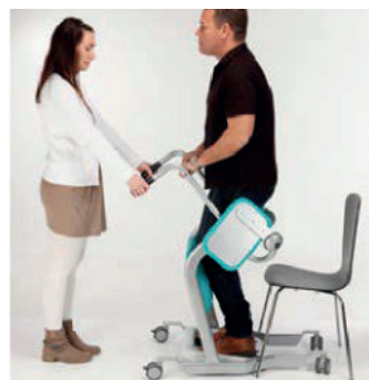
4. Place the Mover Plus so the care recipient can easily place his or her feet on the step and his or her knees/shins against the shin support. Let the care recipient take hold of the crossbars/handles however he or she wishes.