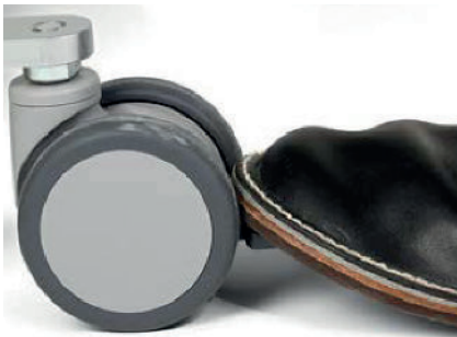
Lock the brakes