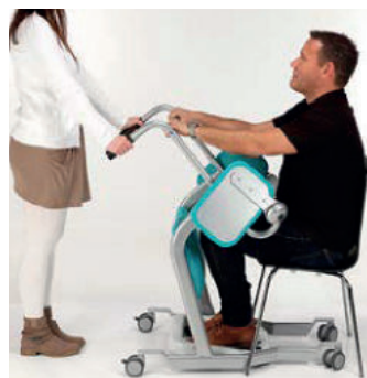
2. Manoeuvre up to the care recipient.