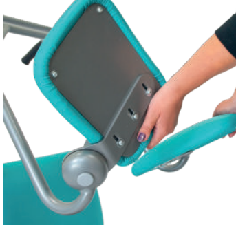
1. Fold up the two half-seats.