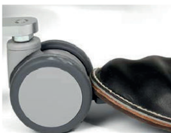
3. Lock the brakes