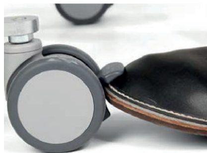
Release the brakes