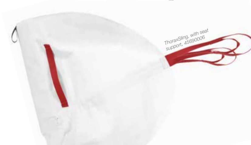
ThoraxSling, with seat support, 45690006