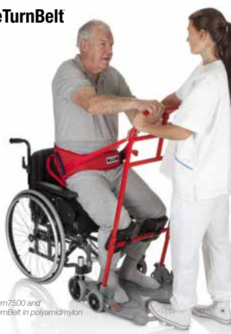
ReTurn7500 and ReTurnBelt in polyamid/nylon

The patented* ReTurnBelt is an excellent complement to Handicare's ReTurn transfer platforms. For users with weak legs and requiring extra support.