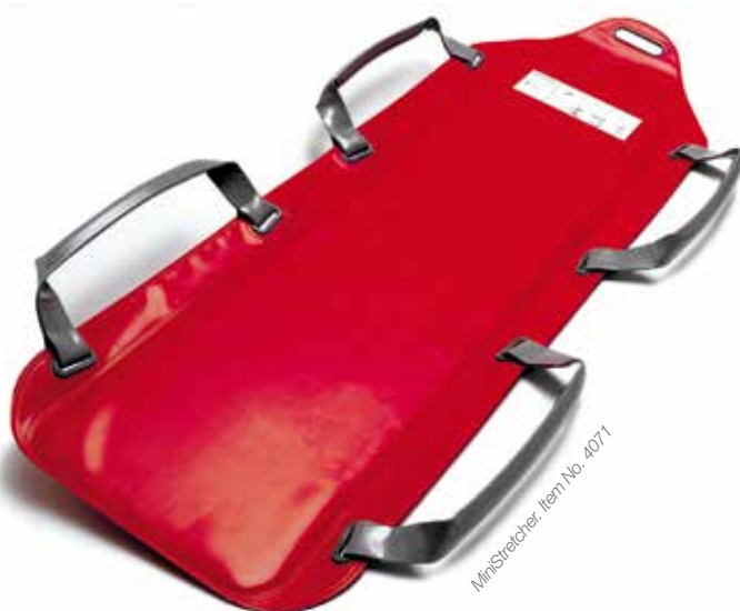
MiniStretcher, Item No. 4071