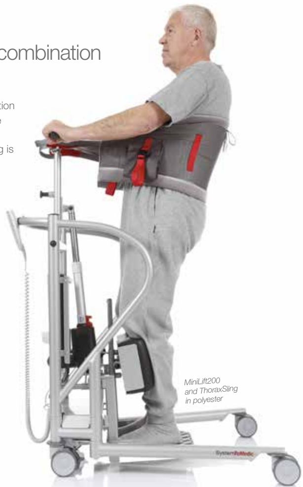
MiniLift200 and ThoraxSling in polyester