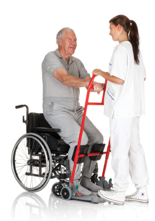
Throughout the entire sit-to-stand procedure, the caregiver must have one foot on the base plate to provide counterweight.