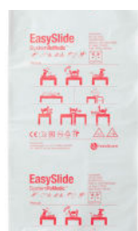
EasySlide, Disposable 2040