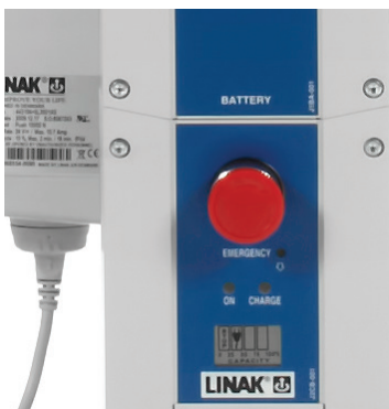
New control box with diagnostics, e.g. lift counter and overload indicator.