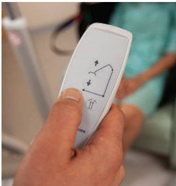
Ergonomic and easy-to-use hand control with 4 buttons.

Eva floor lifts have an emergency stop button easily accessible on the control box. The lift also has both electrical and manual emergency lowering. The battery has high capacity, performing many lifts per charge, which means less frequent charging. An indicator on the control box shows when charging is in progress and when the battery is fully charged. Built-in charging is standard.