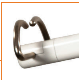
Bull Horn Connector