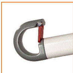
Spring Latch Connector