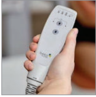
Handheld operation with problem indication and battery level display.