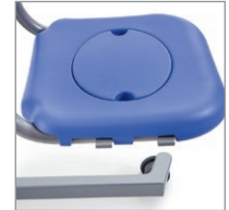
The PUR padding is easily slid onto the stainless steel frame and can be removed at any time.