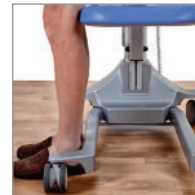
The carrier frame is made from high-quality steel and formed for self-entry.