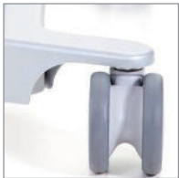
Four high-quality double castors, two of them with brakes, provide easy movement.