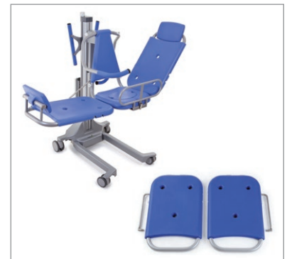
Two removable stretcher lift wings comfortably convert the seat lift into a full stretcher lift. The two modules are easily clicked into an existing safety adapter at the seat tray. Also available with a foot rest. (optional)