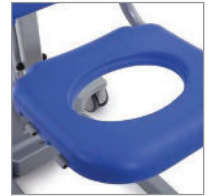
Seat area with large, lockable hygiene opening.