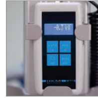
Digital patient scale. (optional)