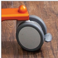
Four high-quality double castors, two of them with brakes, provide easy movement.