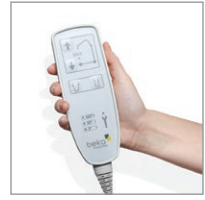
Cable remote control with display of the charging condition of the battery, failure diagnostics, service.