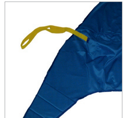
Wide choice of loop slings.