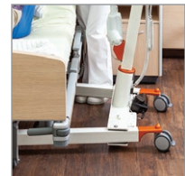
Electrically spreadable legs with low height to pass underneath baths and beds.