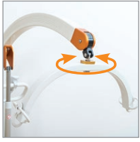
Carrybar with anti-rotation mechanism (ARM) and a free rotation area of 360°.