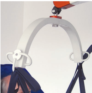
Multi-purpose 6-point carrybar allows an easier and comfortable transfer of the client.