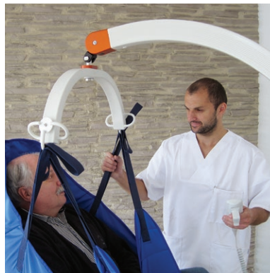
Electrical height adjustment with lowering of the carrybar to the floor. Also includes manual emergency lowering system.